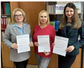
Academics of the Department of Management and Business Law of the Engineering and Economic Faculty